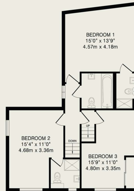
First Floor 686 sq.ft.(63.7 sq.m)approx.

TOTAL FLOOR AREA: 2020 sq.ft.(187.5 sq.m)approx.